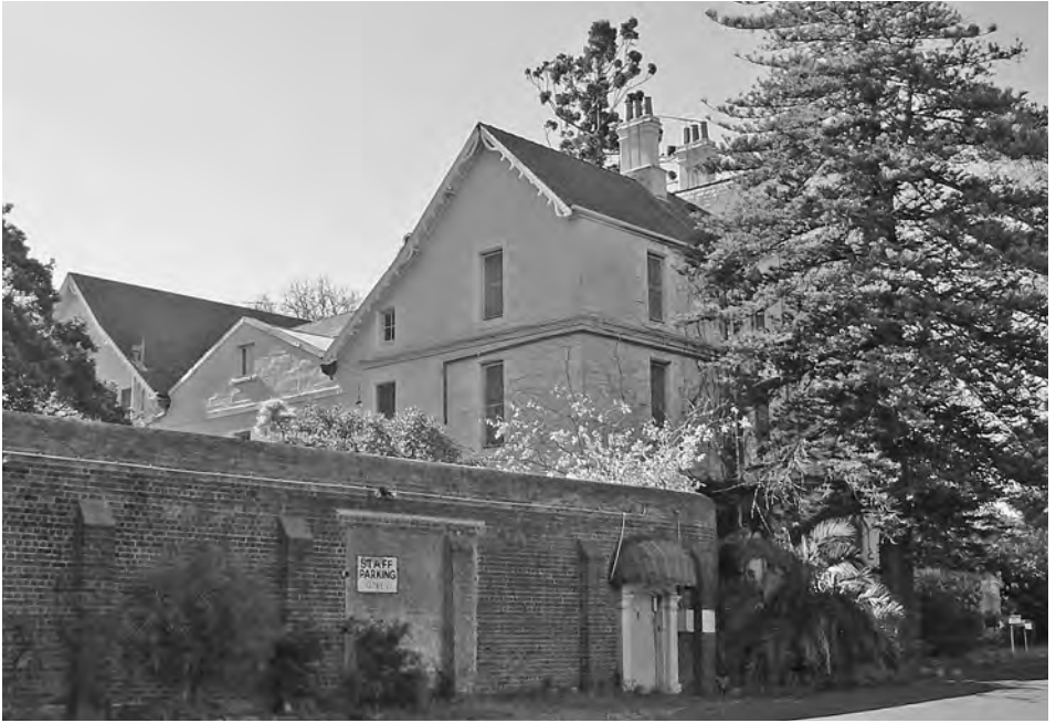
My first glimpse of Parramatta Girls' Home: the main building and high wall