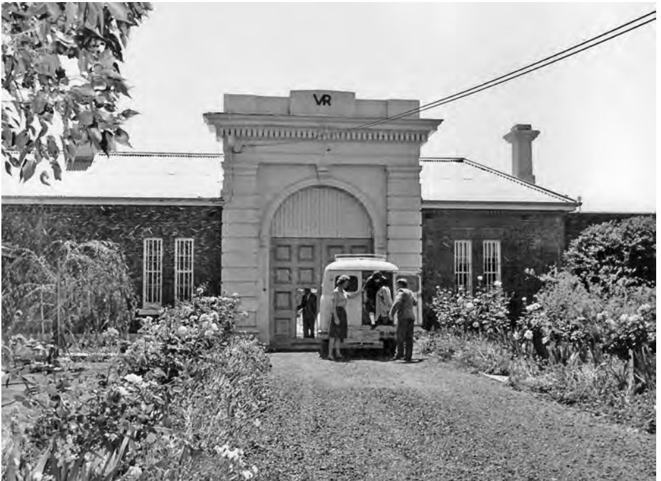
A girl arriving at Hay Institution for Girls, a brutal maximum-security institution for teenage girls