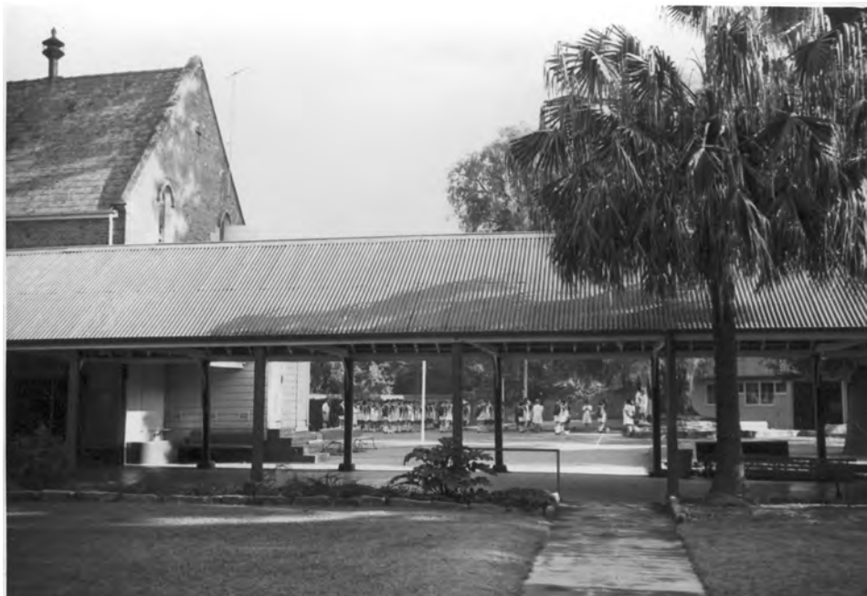
Morning Muster beyond the Covered Way at Parramatta Girls' Home. On the right was our dance area and notice the in-girls' steps on the left.