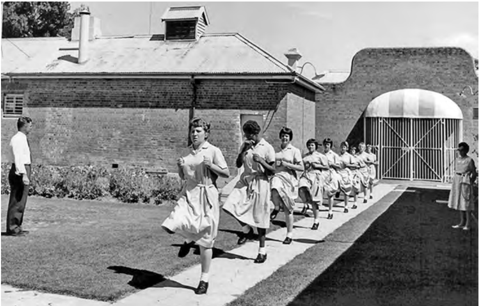
'Eyes down, knees high, elbows in, on the double!' I should have been punished severely for surreptitiously adjusting my glasses without permission.