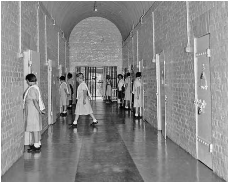
Standing 'at ease' at our cabin doors, waiting for our turn in the ablu-tion parade. I am last in line, at top left, aged only sixteen.