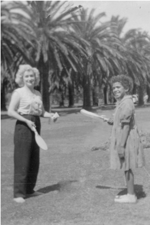
Me, aged about seven, on a Sunday outing in the park with Princess Mummy