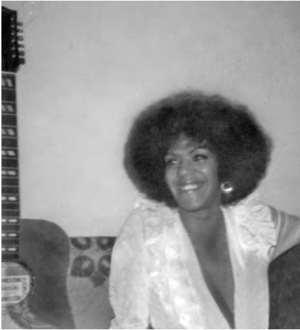
Let My People Come days, 1977