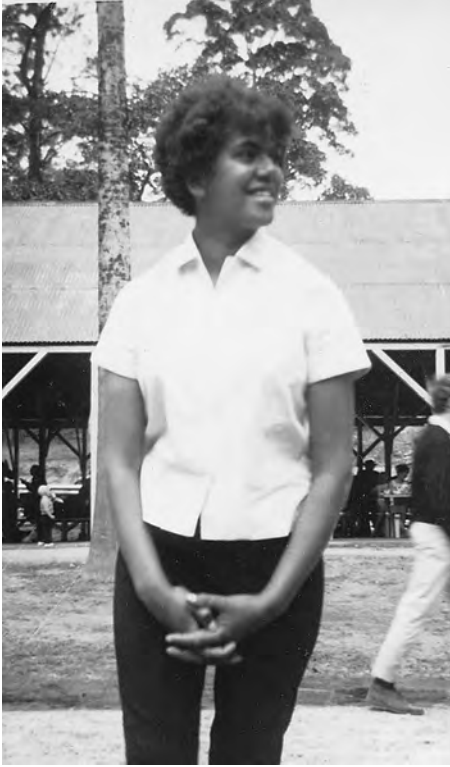
Me in late 1961, just turned thirteen