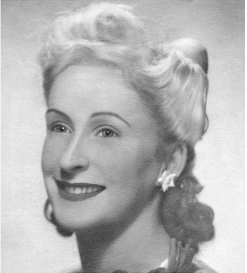
My Princess Mummy