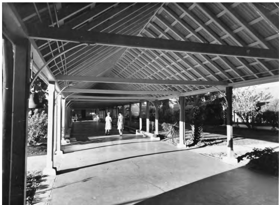
Looking down the Covered Way, the scene of so much misery yet also joy, with dancing and family visits