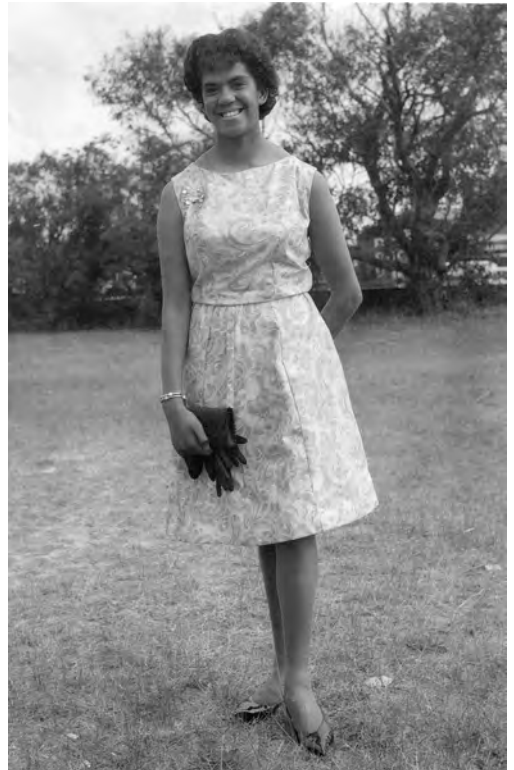
In a very stylish dress I'd made in sewing class in junior high school, 1963