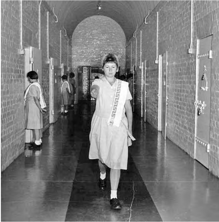
Inside the cell block at Hay Institution for Girls. 'Eyes down, quick march.' We never walked but marched everywhere.