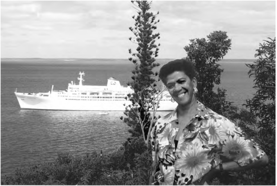
My home-away-from-home: the lovely Fairstar , circa 1991