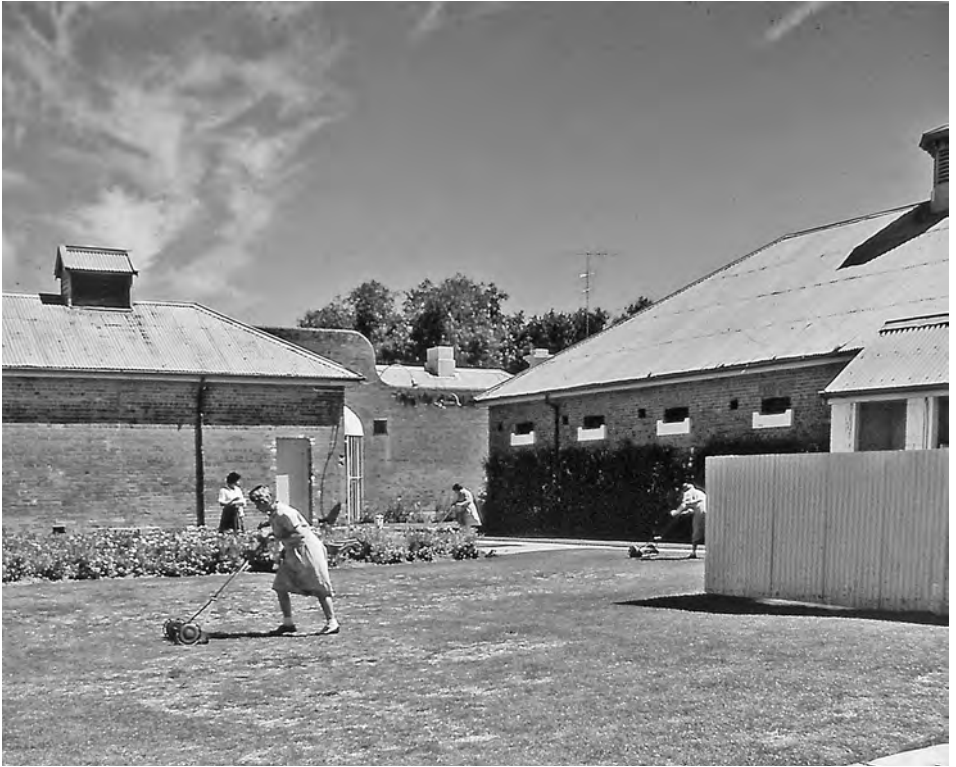
Hard labour, harsh discipline and extreme punishment were standard at Hay