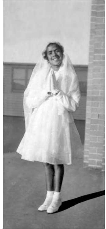
My confirmation at St Martha's, aged about nine