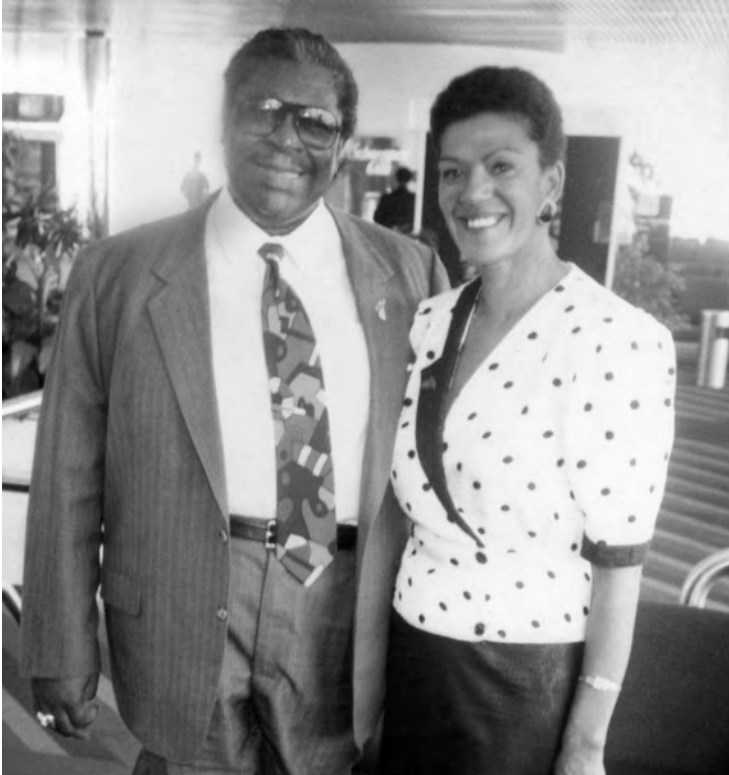
BB King and me on the Phillip Morris Superband Tour, 1991