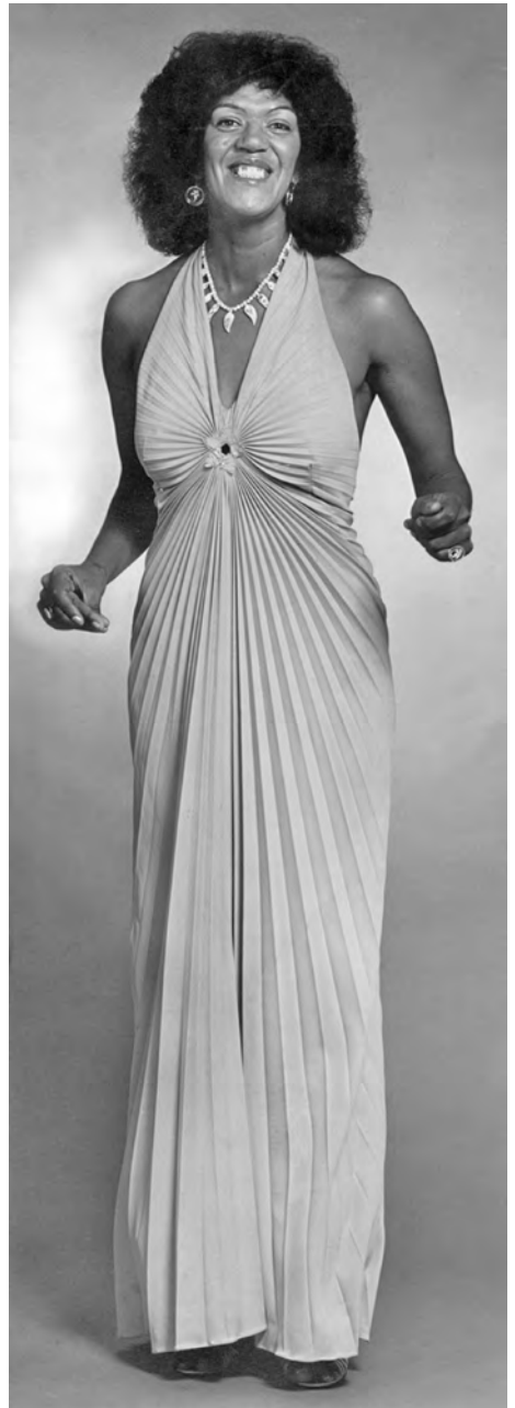
The band singer: weddings, parties, anything, 1978 to 1981