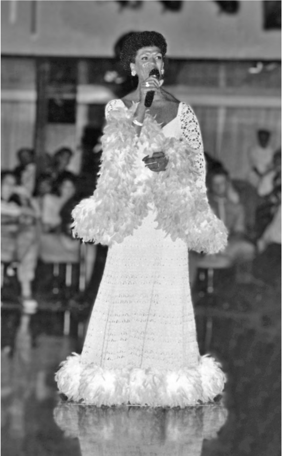
Me, resplendent in Big Bird, late 1980s. I've even added feathers!