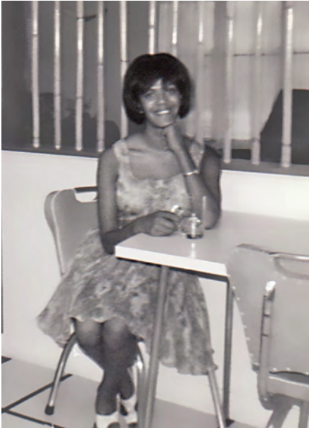
Free at last. In my mother's kitchen in Townsville, 1966.